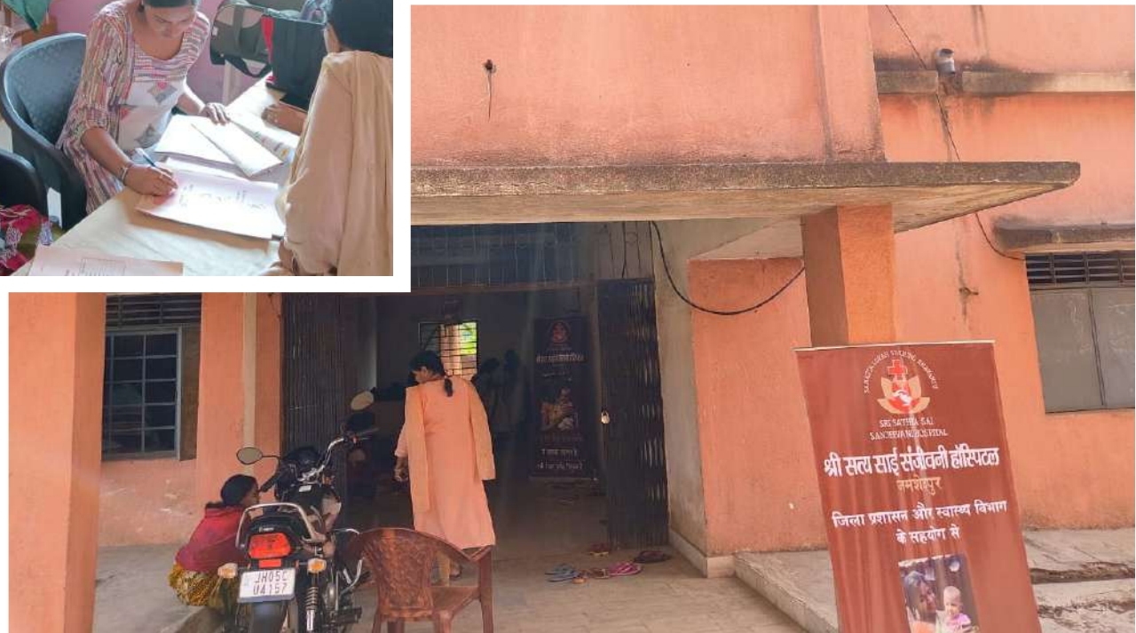
Belajudi, Jugsalai, East-Singhbhum, JH 10 April 2023 35 Women Served