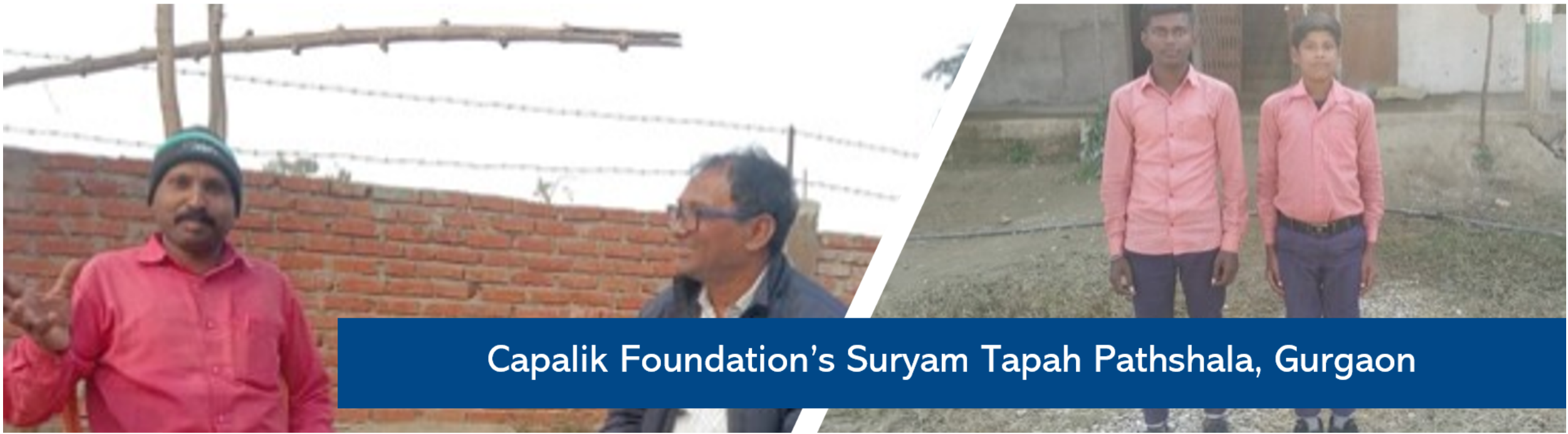
Capalik Foundation's Suryam Tapah Pathshala, Gurgaon