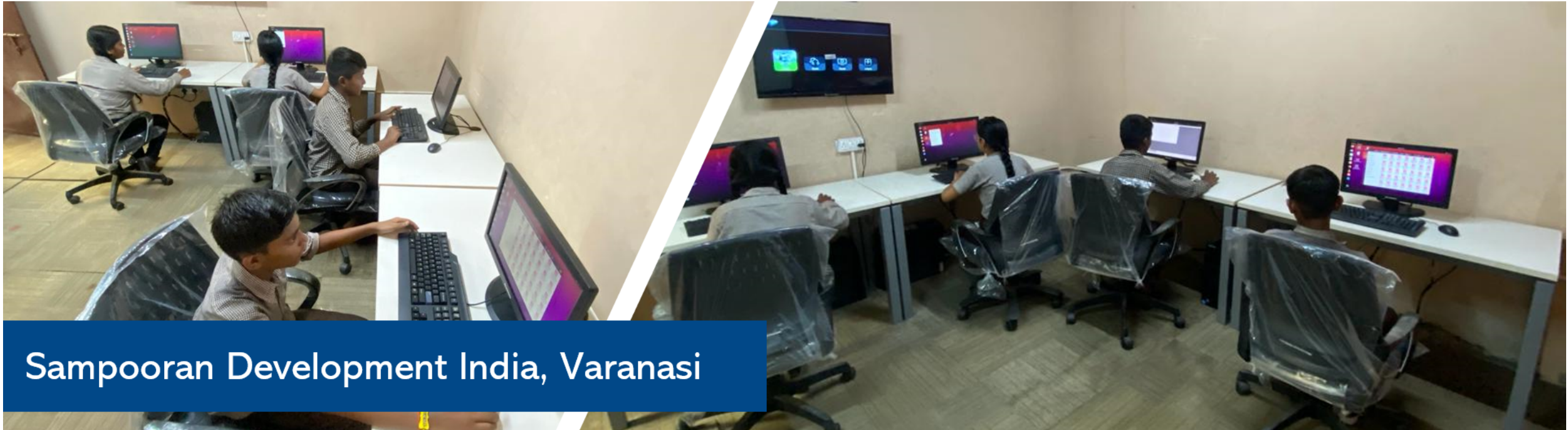
Sampoorn Development India, Varanasi