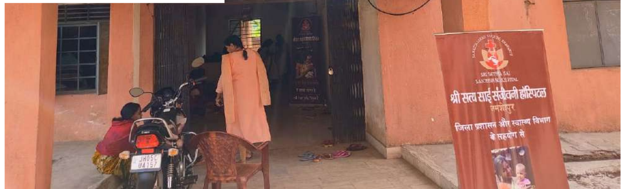
Belajudi, Jugsalai, East-Singhbhum, JH 10 April 2023 35 Women Served